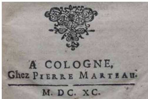
Imprint of fictitious printer Pierre Marteau of Cologne on the title page of a book from the Society's collection