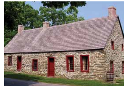
The Abraham Hasbrouck House on Historic Huguenot Street in New Paltz, New York