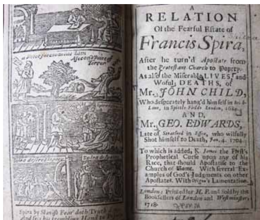
Engraving captioned “Spira by Slavish Fear doth Truth deny, And sets his trembling Hand to Popery” opposite title page of a 1718 edition of Spira's tale

The volume in the collection of the Huguenot Society of America includes an introductory text by B.H. who explains that he has purchased the “Right of the Copy” and “thought it very fit to Reprint ... in this present Age, wherein an apostatizing Spirit seems to be let loose, and not a few ready to shift their Religion (as Seamen do their Sails) with every Wind.” The initials B.H. have been attributed to Benjamin Harris, a successful author and printer in seventeenth- and eighteenth-century colonial America. Spira's plight—death as the consequence of relinquishing one's religion whether by choice or by force—served as a morality tale to keep the flock faithful and true.